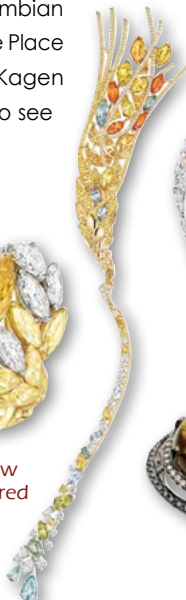
'L'Épi' brooch in platinum and 18K yellow gold set with diamonds and various colored stones – garnets, tourmalines, beryl and peridots.