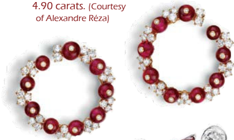
'Farandoles', 18K pink gold earrings featuring 18 spinel beads weighing 26.11 carats and brilliant-cut diamonds weighing 4.90 carats.