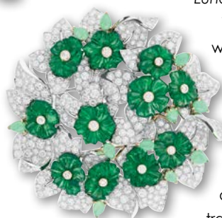
'Claudine', an 18K white and yellow gold detachable clip, diamonds, buff-topped round emeralds, and nine emerald-cut emeralds for a total of 42.07 carats from Colombia.