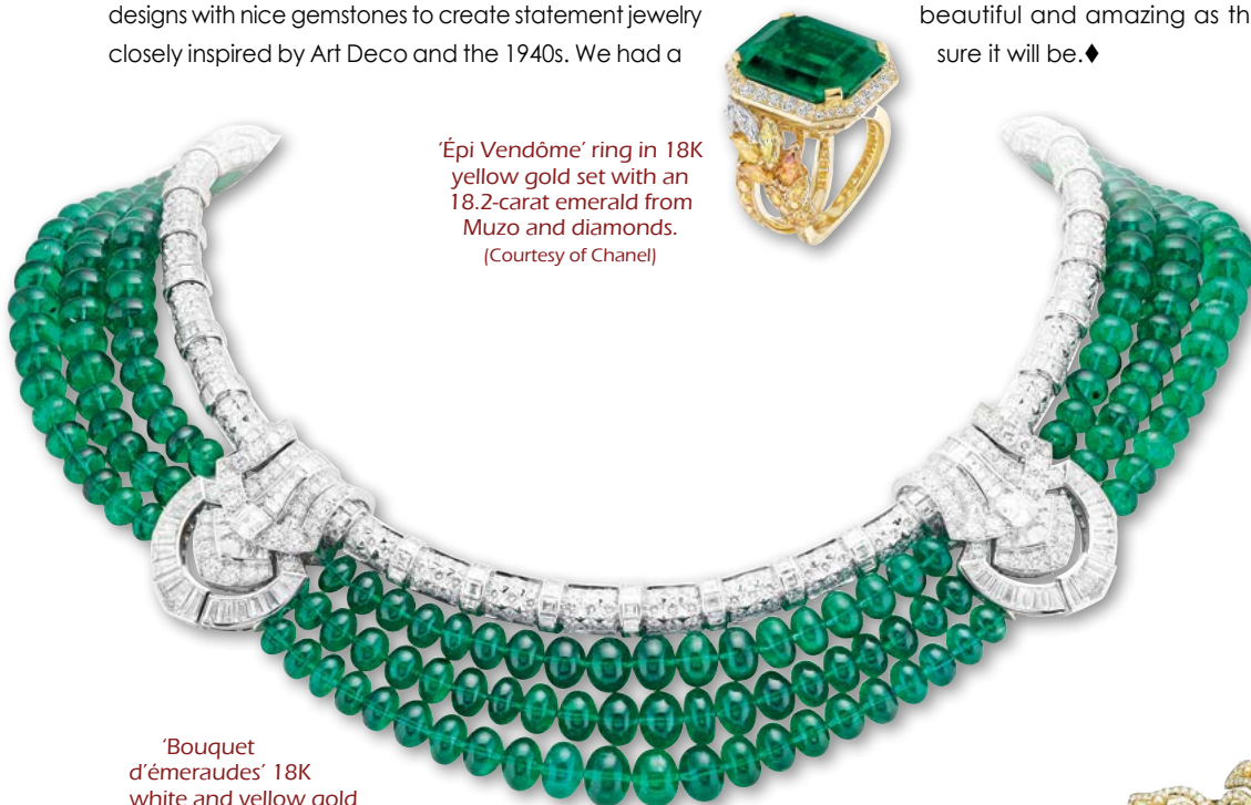
'Épi Vendôme' ring in 18K yellow gold set with an 18.2-carat emerald from Muzo and diamonds.

After a week of viewing wonderful gemstones and impressive collections, it was difficult to come back to real life. This colorful season was a great tribute to French workshops which continue an important and somewhat rare tradition of know-how. We now hope that the next year will be as beautiful and amazing as this year – and we are sure it will be. ♦