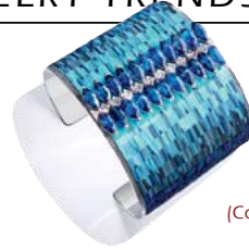
An 18K white gold manchette (cuff bracelet) set with 22 marquise-cut blue sapphires (approximately 23.54 carats) and diamonds. Feathers marquetry. Unique piece.