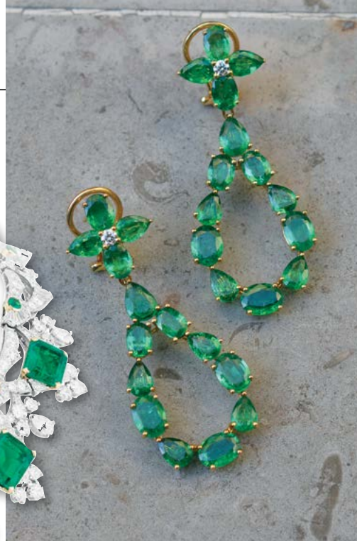
18K yellow gold earrings set with diamonds and 20.21 carats of Zambian emeralds.

the magnificent gems chosen with special care by Van Cleef and Arpels for their new collection – 'Emeraude en Majesté' – exclusively designed to glorify this precious green gem. There is a 'Canopée' ring set with a 13.52-carat Colombian emerald; the 'Grand Opus', a necklace featuring three old-mine engraved emeralds weighing 127.88 carats; and the 'Lune d'Eau' ring set with three carats of Zambian stones.