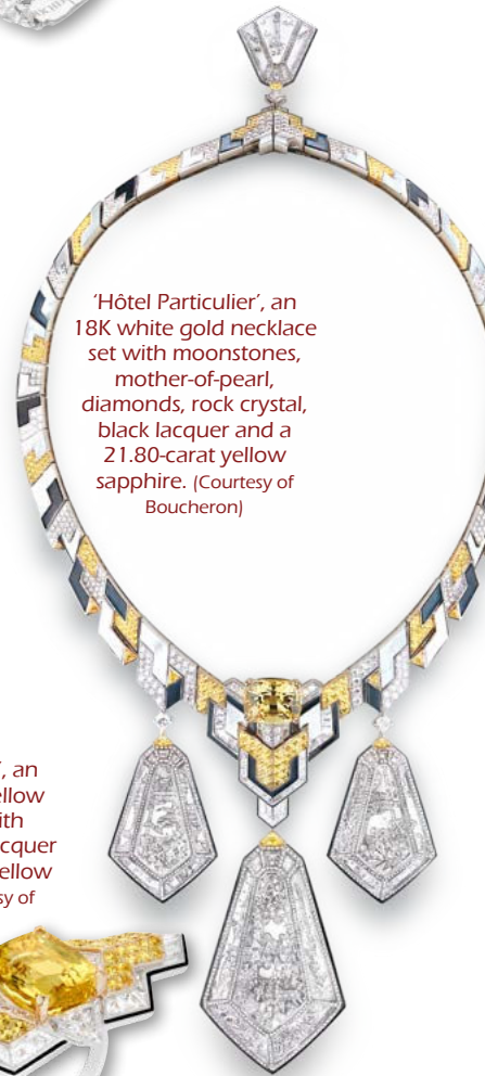
'Hôtel Particulier', an 18K white gold necklace set with moonstones, mother-of-pearl, diamonds, rock crystal, black lacquer and a 21.80-carat yellow sapphire. (Courtesy of Boucheron)