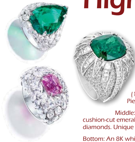
Top: An 18K white gold ring set with a pear-shaped emerald from Colombia (12.06 carats) and diamonds. Unique Piece.