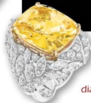
'Moisson d'Or' ring in 18K white and yellow gold set with a 17.1-carat cushion-cut yellow sapphire and diamonds.