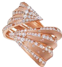
'Dune', an 18K pink gold cuff bracelet featuring two pear-shaped diamonds and 152 brilliant-cut diamonds weighing 31.48 carats. (Courtesy of Alexandre Réza)