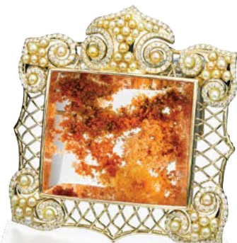
'Nature Framed', 18K yellow gold set with a 106.52-carat dendritic quartz, diamonds and natural pearls.