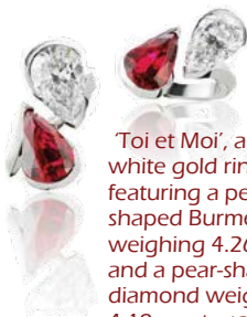
'Toi et Moi', an 18K white gold ring featuring a pear-shaped Burmese spinel weighing 4.26 carats and a pear-shaped diamond weighing 4.19 carats.