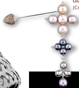
'The Sleeping Beauty', an 18K white gold brooch set with diamonds and freshwater pearls. (Courtesy of Suzanne Syz)