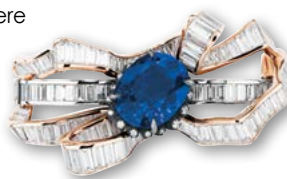
'Salon de l'Abondance' brooch: 18K white and pink gold, darkened silver, diamonds and sapphire.