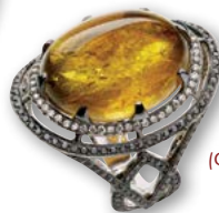
'Passamaneria', an 18K white gold ring set with diamonds and a sugar-loaf antique tourmaline.