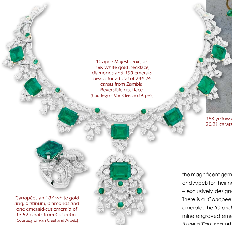
'Drapée Majestueux', an 18K white gold necklace, diamonds and 150 emerald beads for a total of 244.24 carats from Zambia. Reversible necklace.