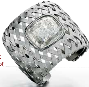
A titanium cuff bracelet featuring a 76-carat rose-cut diamond.