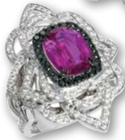
'Jolie môme' an 18K white gold ring set with white and black diamonds, an unheated 4.14-carat Mozambican sapphire.