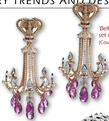
'Belle Epoque', 18K red gold earrings set with diamonds and pink sapphires.