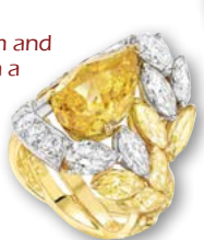
'Épi Solaire' ring in platinum and 18K yellow gold set with a pear-cut 5.4-carat fancy vivid orange-yellow diamond and diamonds.