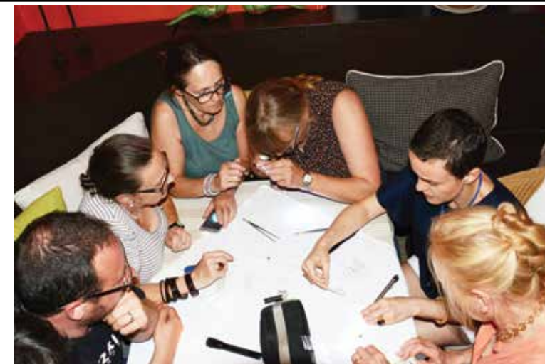
The famous "Quiz" where contestants had to identify gems using only the light of a simple lamp and a magnifying glass.