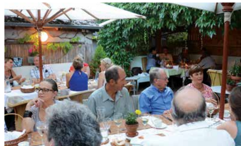
Delicious meals and camaraderie during the Poil event.