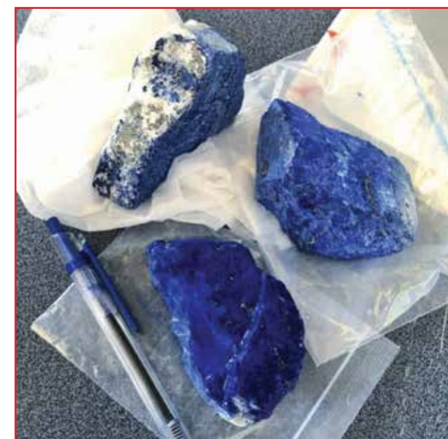
Examples of impressive natural lapis lazuli from Afghanistan.